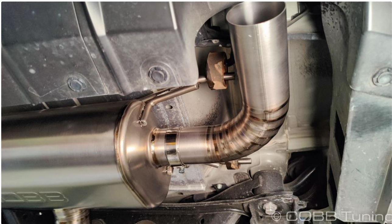
12. Loosely fit the tip into place on both sides using the two remaining exhaust clamps.