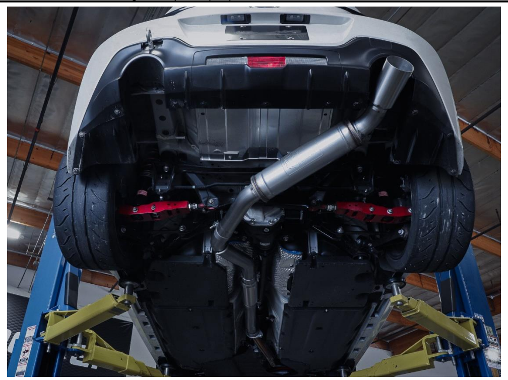
Page 1 of 2

Install V-band clamps with anti-seize lubricant and hand tighten only to torque specifications of 10-15 ft-lb.