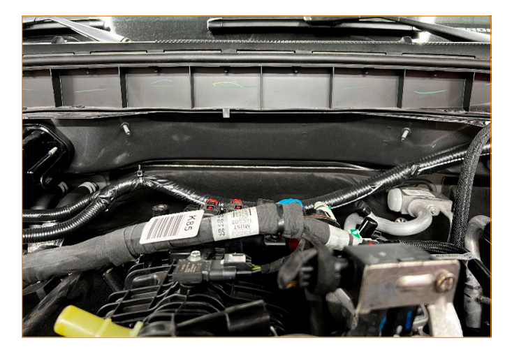
04. Install the catch can bracket to the firewall studs and fasten using 2x M6 locking nuts and washers.