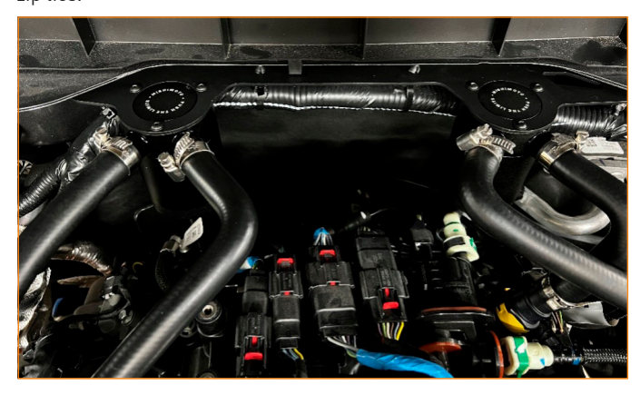
07. Attach PCV-side catch can hoses as shown and secure with provided worm gear clamps. Push down on the fittings to engage the barb, then push in the yellow locking tab.