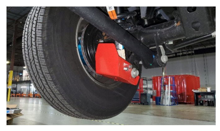
Congratulations! You have completed your installation.