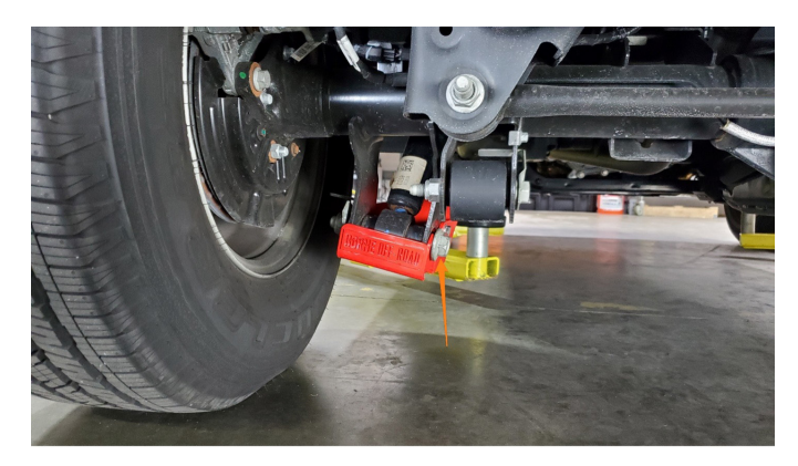
NOTE: If you do not have a torque wrench that reaches 350 lb-ft, tighten the bolt to 150 lb-ft and mark it as shown in the photo below. Then, tighten the bolt an additional half turn (180°).

07. Once both skid plates are installed and the lower strut mounting bolts and nuts are loosely tightened lower the vehicle back onto the ground. When tightening suspension components with bushings they should always be tightened when they are loaded with the full weight of the vehicle. Using a 27mm socket tighten each lower strut mount bolt to the factory torque of 350 lb-ft.