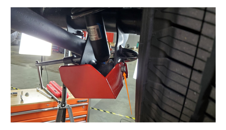
04. Install (2) supplied M10 bolts, (2) supplied flat washers, & (1) supplied bar nut as shown in the photo below. Tighten each bolt to 25 lb-ft (34 Nm).