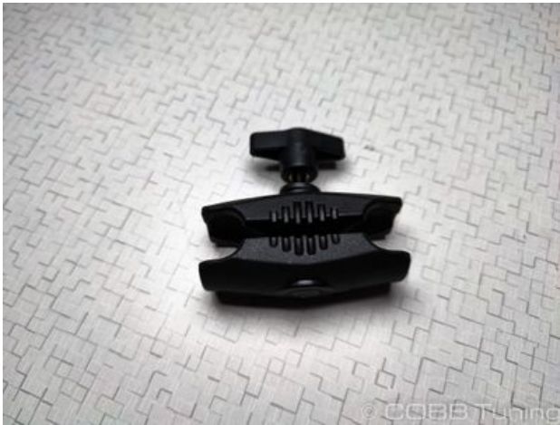
✓ Ball Mount