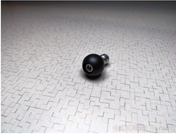
✓ M6 x 1 x 35 Socket Head Bolt