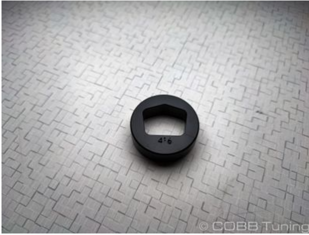
✓ 25mm Ball to Dual T-Slot Adapter