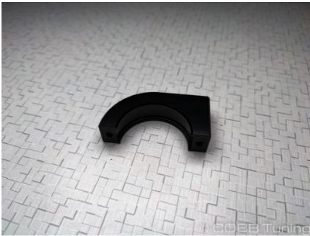
✓ #400 Rubber Insert (2021 F150/Raptor)