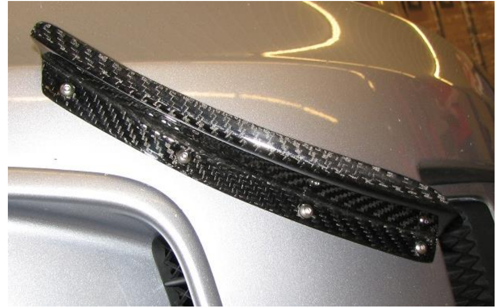
2.15. Reaching your hand behind the front bumper you can start threading on the washer and then the nyloc nut.