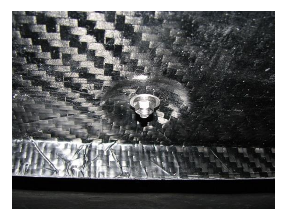
2.21. Now that we know where the double sided tape will be installed on care, we need to clean this area with alcohol and water mix.

Side Splitter Kit, 987 Cayman – Install Manual