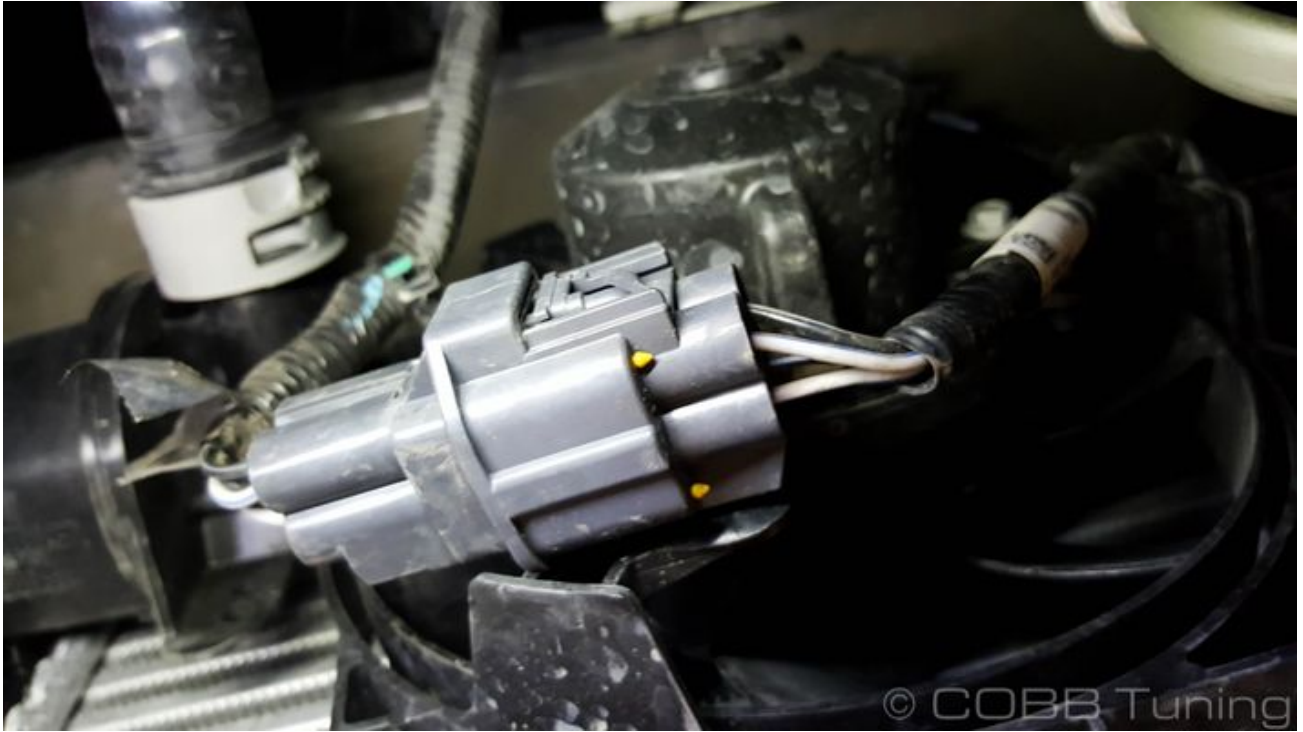
3. Disconnect electrical plug going to the electronic bypass valve.