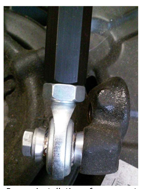
Proper installation of spacers at knuckle.

Do not exceed 20 ft.-lbs. when tightening the link to the car. Leave one endlink bolt disconnected (other endlink bolts should be connected). Place the car (all 4 wheels) on flat ground, then adjust the length of the disconnected endlink until the bolt inserts easily into the sway bar. That will be the length setting to use. Assemble and tighten that endlink accordingly. Torque the Jam Nut (3 or 4) (length setting of endlink) to 20-30 ft.-lbs. DO NOT OVERTORQUE! SPL Parts is not liable for any issues due to overtorque.