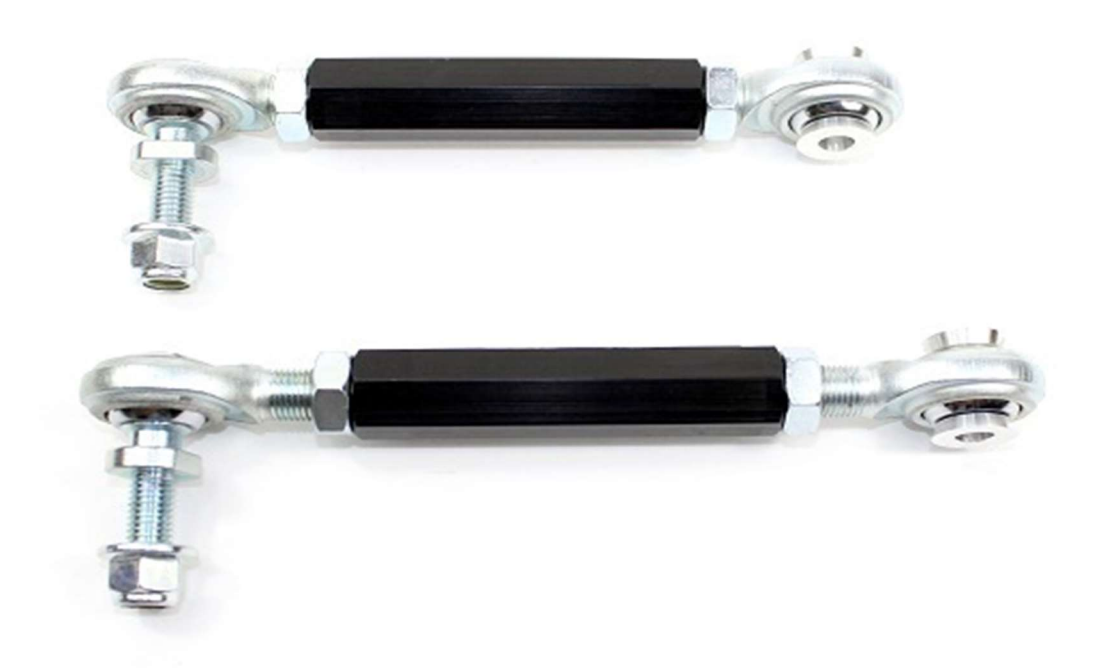
Minimum and maximum adjustment illustrated. Adjust both sides evenly to avoid overstressing the rod ends.

Thank you for your purchase of this SPL Parts performance suspension product. Please follow these instructions exactly to ensure that the product is able to function to the best of its ability, and you can achieve the most performance out of your vehicle.