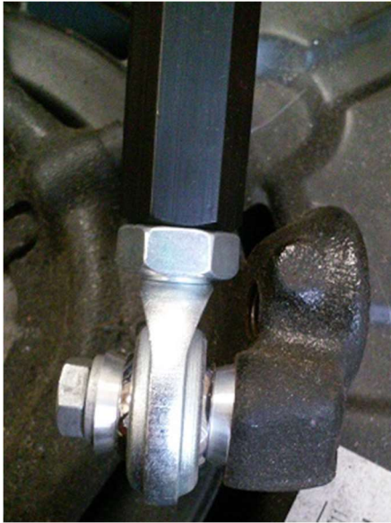
Proper installation of spacers at knuckle.

Do not exceed 20 ft.-lbs. when tightening the link to the car. Leave one endlink bolt disconnected (other endlink bolts should be connected). Place the car (all 4 wheels) on flat ground, then adjust the length of the disconnected endlink until the bolt inserts easily into the sway bar. That will be the length setting to use. Assemble and tighten that endlink accordingly. Torque the Jam Nut (2 or 3) (length setting of endlink) to 20-30 ft.-lbs.