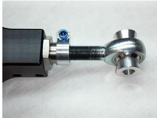
Overextended rod end.