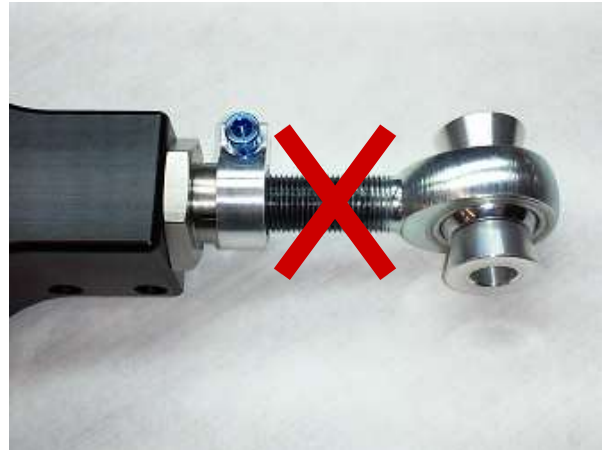
Overextended rod end.