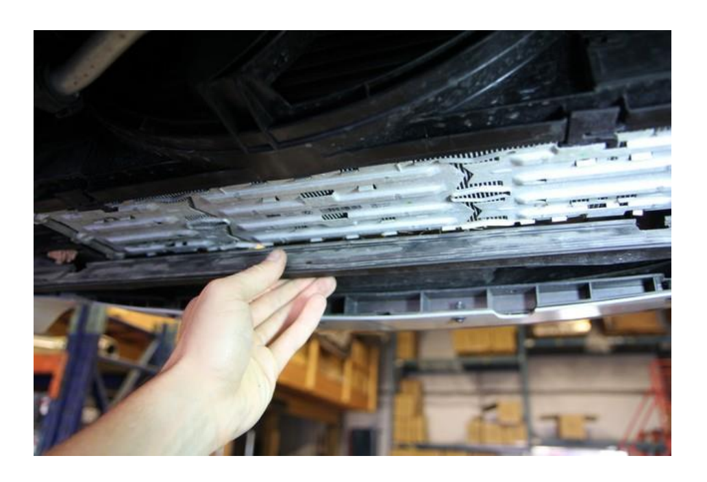
Step 3: Push the plastic cover down and lower the factory intercooler (will not be reused). Pull down carefully. Remove charge pipes and take out the factory intercooler.