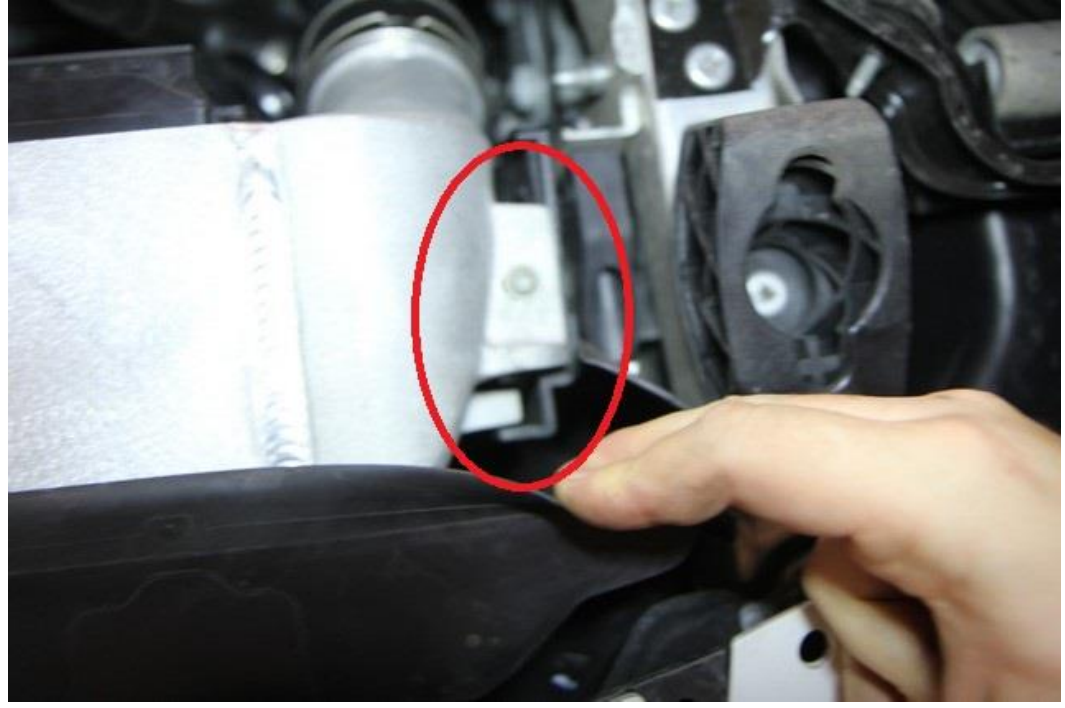
Step 5: Clip in charge pipes and reinstall bellypan. Test drive vehicle.