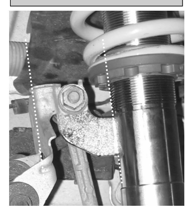
ATTENTION: Mount the brake line holder parallel to the coilover strut.